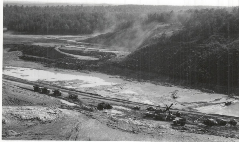
'66 DeGray Dam