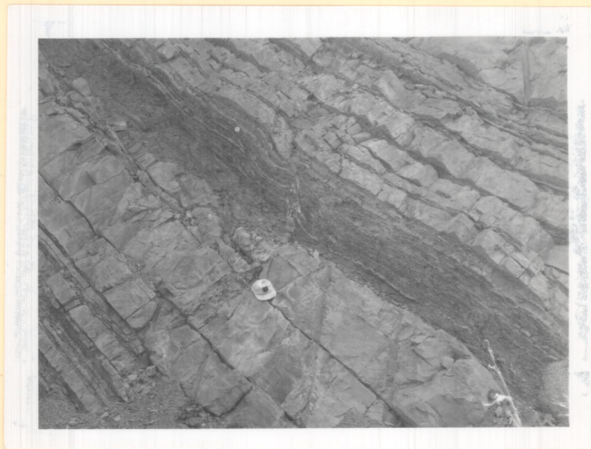
East Wall fault, DeGray Spillway, Haley Jan. '73