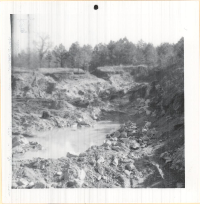
'73 East end Wurner Soap. Pit