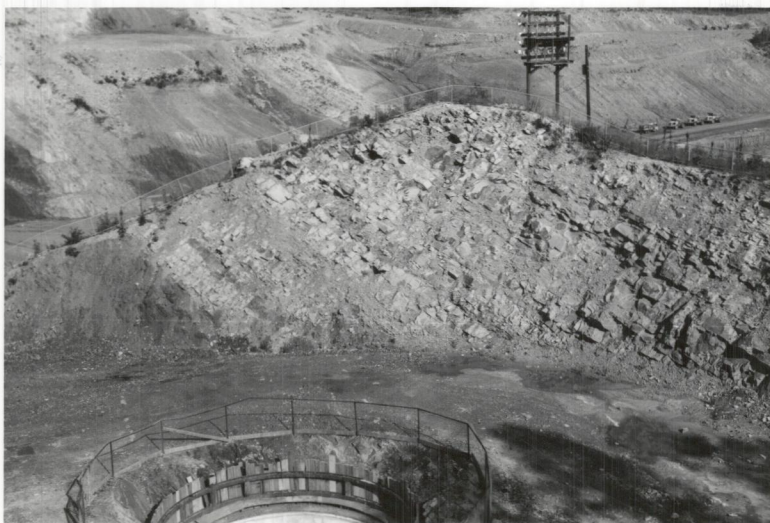
'66 DeGray Intake