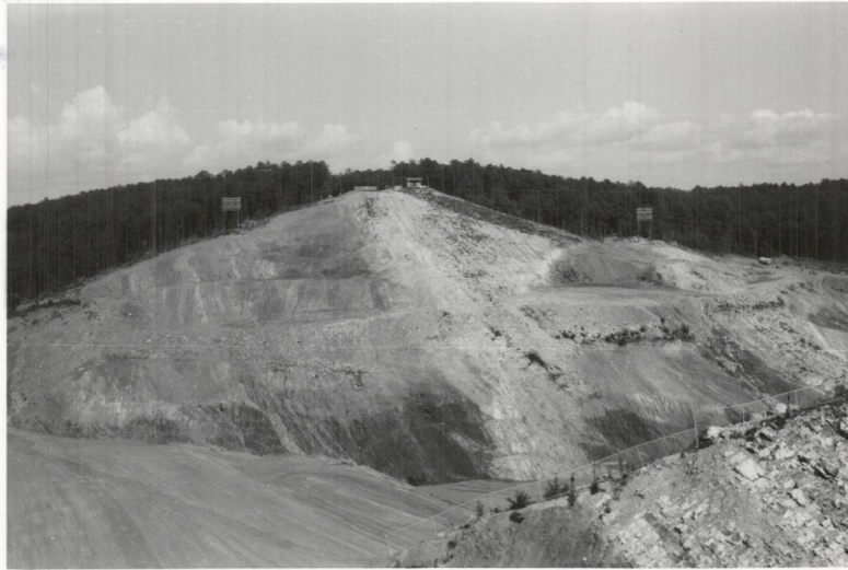
'66 DeGray Dam