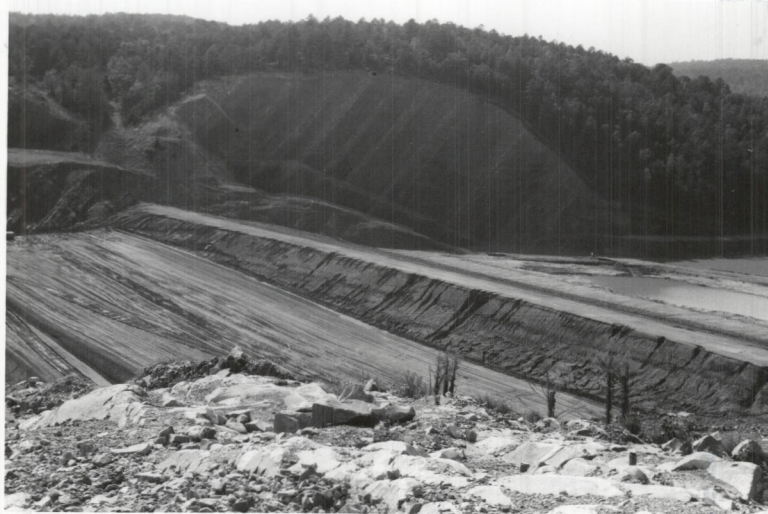
'67? DeGray Dam